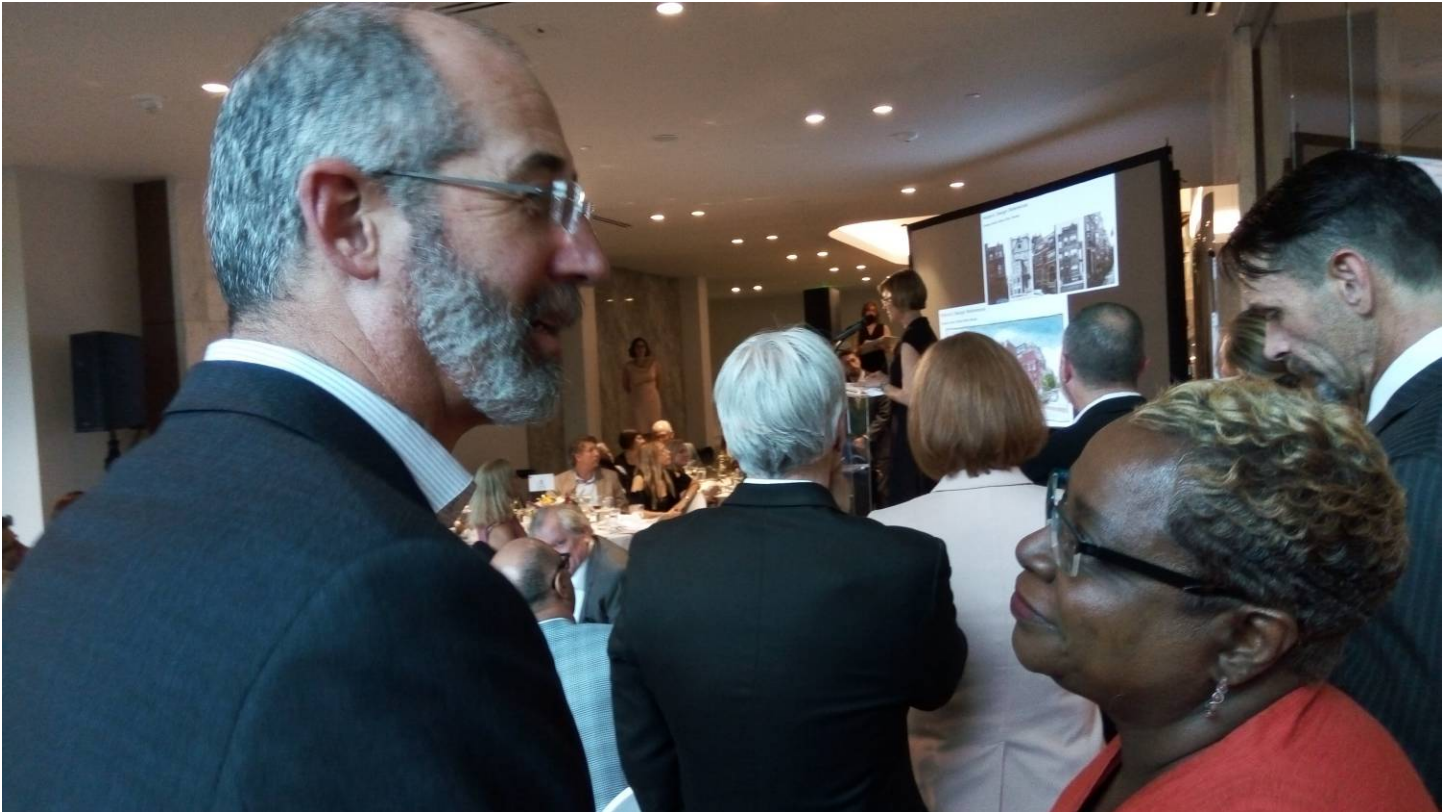
Waiting to accept award